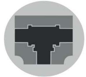
SOCKET WELD TEE