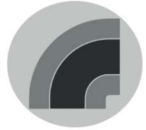
90° LONG RADIUS ELBOW