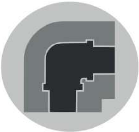
90° SW SHORT RADIUS ELBOW