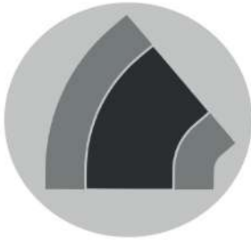
45° LONG RADIUS ELBOW