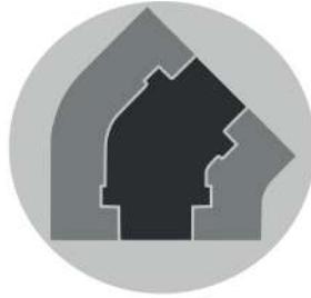
45° SW SHORT RADIUS ELBOW